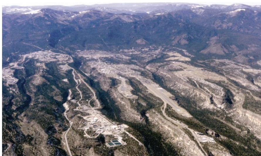
Low vantage point: the loss of the preprint server is a blow for the lab on the New Mexico mesa.

Los Alamos experienced a painful security clamp-down after Wen Ho Lee, a Taiwanese-born engineer at the laboratory,