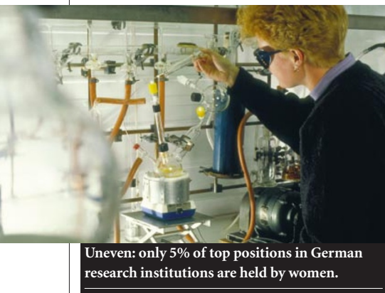
Uneven: only 5% of top positions in German research institutions are held by women.