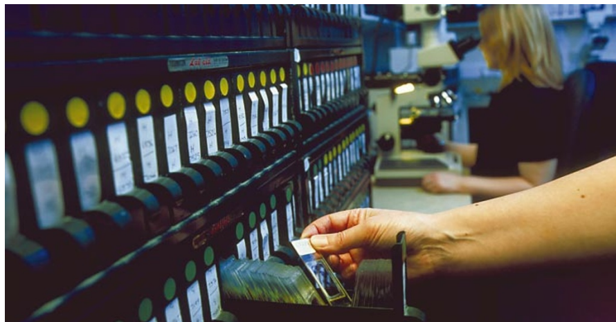
Fast track: rapid testing of brain samples will help to clarify whether Britain's sheep have BSE.

King said he was "confident" that the tests will gather a significant amount of data in a