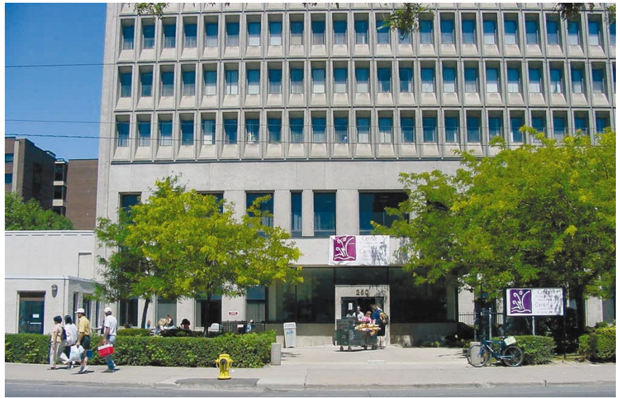
Focus of controversy: the Centre for Addiction and Mental Health in Toronto.