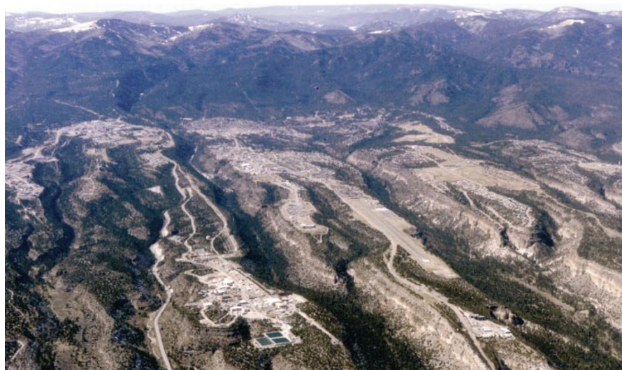
Low vantage point: the loss of the preprint server is a blow for the lab on the New Mexico mesa.

Los Alamos experienced a painful security clamp-down after Wen Ho Lee, a Taiwanese-born engineer at the laboratory,