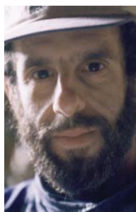
Paul Ginsparg; set to move to Cornell.

$300,000 in annual funding from the National Science Foundation, the Department of Energy, which runs the lab, and LANL itself.