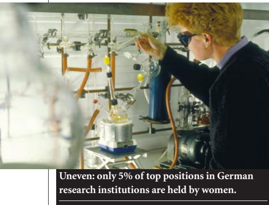
Uneven: only 5% of top positions in German research institutions are held by women.

Supporters of a quota system include Sybille Krummacker, a scientist at the national research centre in Jülich (FZJ), who helped to set up Germany's first women-only tenure-track programme. "The programme has encouraged many women to apply," says Krummacker, "and they are not employed just because they are female, but because they are highly qualified." ■