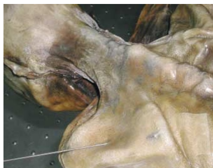
Iced: an arrowhead gives a clue to the reasons why Ötzi's body was found unburied.

Conservators at Ötzi's final resting place, the South Tyrol Museum of Archaeology in Bolzano, Italy, announced that an X-ray analysis had shown the arrowhead — 21 mm long and 17 mm wide — to be lodged under his left shoulder. Computer tomography had also revealed a 2-cm hole in his shoulder