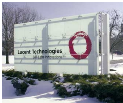
Ring of confidence? Lucent managers hope to avoid forced redundancies among researchers.

Washington The gloom surrounding Bell Laboratories deepened last week as Lucent Technologies, the telecommunications company that operates the labs, announced financial results that exceeded the worst