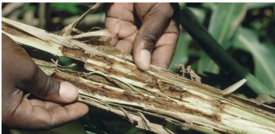
Lending a hand: could biotech prevent damage to sorghum caused by the pest Eldana saccharina ?

Elsewhere the report recommends eliminating costly government monopolies in telecommunications as well as increasing resources for non-primary education. It also backs the development of "appropriate technologies" such as low-literacy touch-screen computers and low-maintenance fuel cells. And it advocates more efforts to develop vaccines for malaria and AIDS and for less-publicized scourges such as river blindness. ■