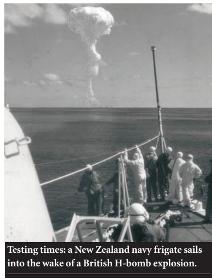
Testing times: a New Zealand navy frigate sails into the wake of a British H-bomb explosion.

The New Zealand veterans' association is planning legal action against the British government for allegedly neglecting its duty of care. Previous claims by individuals have been unsuccessful or settled out of court, with no admission of fault by the government.