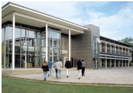
On the up: the European Bioinformatics Institute is benefiting from an injection of cash.

Of the total grant to the EBI, 4.3 million euros each year will go directly to the institute for its own operations, adding to existing support of 8.4 million euros per year from the European Molecular Biology Labo-