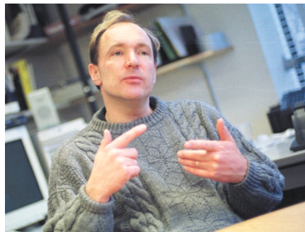
Talking point: Tim Berners-Lee backs more participation from computers in web publishing.

These new products will help users communicate with each other even before a common vocabulary has developed to express the concepts they have in common. The semantic web will provide unifying underlying technologies to allow these concepts to be progressively linked into a universal web of knowledge. Thus it will aid in breaking down the walls of miscommunication, allowing researchers to find and understand products from other scientific disciplines. The very notion of a journal of medicine separate from a journal of bioinformatics, separate from the writings of physicists, chemists, psychologists and even kindergarten teachers, will some day seem as out of date as the