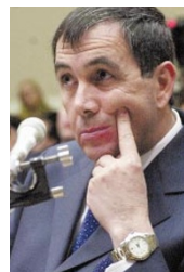
Panos Zavos: would pre-screen human embryos.

Other witnesses sought to draw distinctions between good and bad science and between safety and ethics. Congress's perception of such distinctions is likely to shape any legislation or regulation of cloning. A focus on safety, rather than ethics, might provide a basis for regulation by the Food and Drug Administration, the hearing was told.