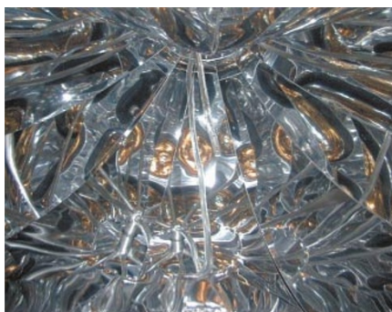
Physics equipment, such as this dark-matter detector, will compete with astronomy projects.