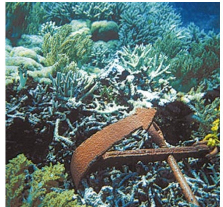
Damage done: bleached coral in Indonesia.