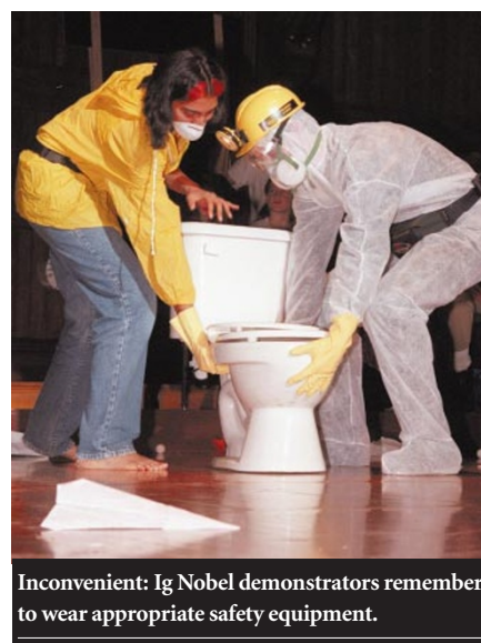
Inconvenient: Ig Nobel demonstrators remember to wear appropriate safety equipment.

The event ended with words of encouragement from master of ceremonies