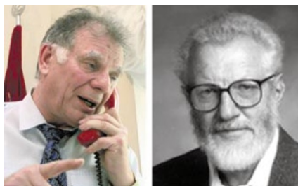
Alferov (left) and Kroemer: worked on transistors.