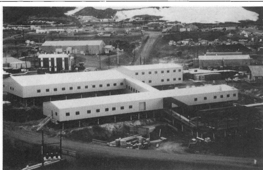
Nearly finished, in this October 1990 view, the new science laboratory at McMurdo Station.