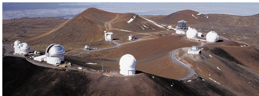
Looking up: expansion plans for the facilities at Mauna Kea have been welcomed by astronomers.