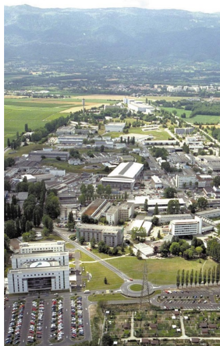
Collision course: Israeli physicists are divided over the benefits of full membership of CERN.