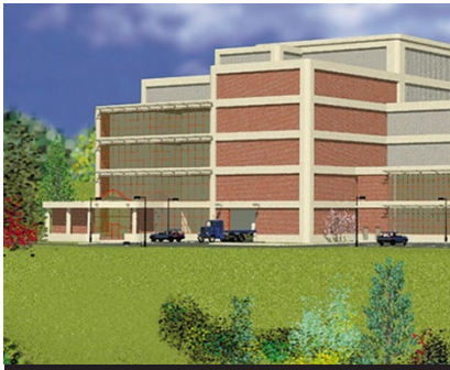
Waiting game: plans for the Canadian Neutron Facility still need government funds.

uranium) designs for nuclear power stations have had some export success.