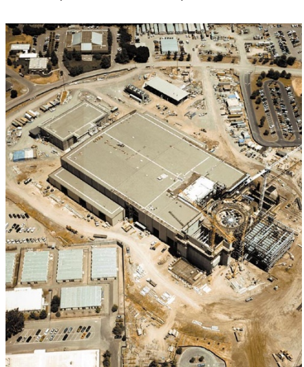
Costly: but NIF construction is proceeding steadily.

External reviewers knew that the project couldn't be built for $1.2 billion, but declined to say so in public. According to Grunder, who served on a National Academy of Sciences panel that reviewed the NIF proposal in 1997, the panel believed that the project would cost $1.7 billion to complete, but didn't put the figure in its published report.