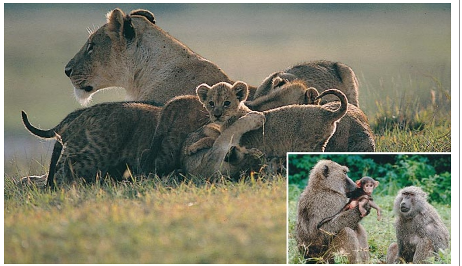
Figure 1 Good mothers — lioness and female olive baboon with young. Packer et al. <sup>1</sup> have studied these animals and conclude that reproductive cessation is a non-adaptive consequence of senescence, rather than an adaptation to enable grandmothers to help rear their daughters' young.

The first adaptive theory proposes that, because birth defects increase with maternal age, menopause protects the human gene pool. The flaw in this 'group selection' theory