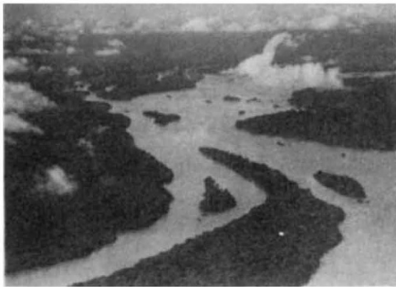
Caracarahy rapids, Rio Branco

have "been welcomed by the Brazilian authorities because of the practical benefit to both farmers and conservationists". They involve an ecological survey, the development of management plans for the reserve, an examination of forest regeneration and the behaviour of soil moisture, a medical-entomological review and a survey of land development.