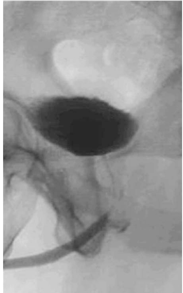
Figure 2 Urethrography demonstrating a bulbar urethral lesion.

Perineal abscess formation is a rare condition. Most of them are considered as being idiopathic. 3 They can be associated with chronic inflammatory bowel diseases, like M Crohn 3 or tuberculosis. Spontaneous or iatrogenic perforation of the urethra, however, for example during prostatic urethroplasty 4 or urethral fistula/diverticula may also lead to abscess formation. Abscess formation as a complication of intermittent catheterization has only once been described previously. 5 In contrast to the other case report, the abscess in our patient was not visible during physical examination already. If the diagnosis is not as obvious, these abscesses may well be missed by standard clinical evaluation. In our case, we were not able to diagnose the abscess by perineal or transrectal ultrasound during initial examination. It was