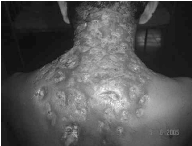
Figure 1 Erythematous indurated plaque like lesion over the nape of neck and upper back with multiple purulent discharging sinuses

recorded a total of 11 cases in the world literature. Eftekhari et al 2 found only 13 cases with actinomycosis related spinal neurological deficit. First reported case of an epidural spinal abscess owing to Actinomycosis, which required surgical drainage and use of IV penicillin (first since its advent) was in 1981. 3 Actinomycosis is mainly caused by Actinomyces Israelii species. A naeslundii , A odontolyticus , A viscosus and A meyeri are less commonly involved. However, most of the