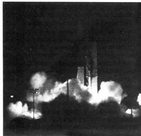
The Solar Mesosphere Explorer (SME) satellite (left) was successfully launched on 6 October by a NASA Delta rocket (right) together with the "amateur" satellite UOSAT (built by a team from the UK University of Surrey). Both satellites achieved their planned orbits. The SME satellite will investigate processes affecting the distribution of ozone in the Earth's upper atmosphere. (For a full description of the mission, see Nature 24 September, p.259.)