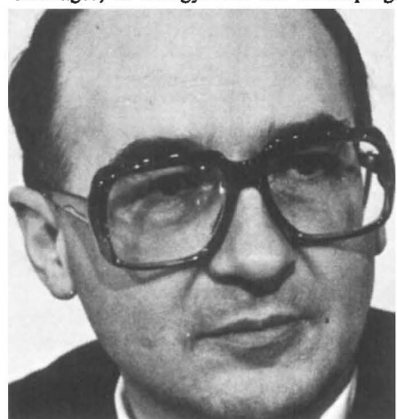
Brunner; fundamental choices

This is an especially significant time for the conference. Prospects for the world economy are clouded, and governments are worried about the rising cost, and shortages, of energy. For the developing