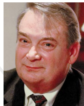
The winners: Robert Furchgott (left), Louis Ignarro and Ferid Murad.

pharmacology”. Moncada’s achievements were recognized when he was elected as a foreign associate of the National Academy of Sciences in 1994. The citation says that he “discovered that mammalian vascular tissues generate nitric oxide that is biosynthesized from L-arginine. He elucidated the relevance of this pathway as a universal transduction mechanism for the regulation of cell function and communication”.