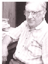
Pople: work has 'led to an industry'.

Kohn developed what was later to be called density functional theory in 1964, with applications in physics in mind. This theory is now widely used to calculate the