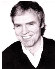
Physics laureates: Robert Laughlin (left) shortly after hearing of his award, Daniel Tsui (centre) and Horst Störmer.

[LONDON] This year's Nobel prize for physics has been awarded to the researchers who first observed and explained the fractional quantum Hall effect. This is the effect in which an electric current within a two-dimensional conducting material appears to be made up of charge carriers bearing a fraction of the charge on an electron.