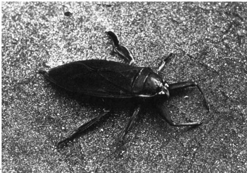
Lethocerus : $5,000 market