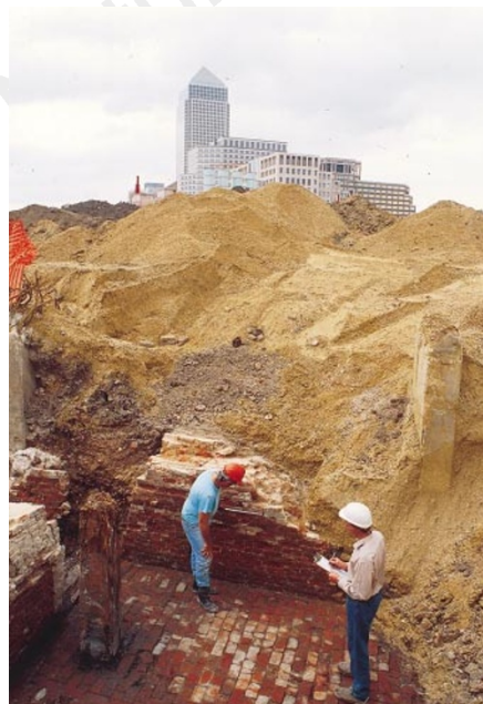
A dig at Lime Kiln Dock in London, overlooked by the tower of Canary Wharf.

Interest in combustion research has grown in recent years because of public pressure to find cleaner, more efficient means of energy production, which will all involve combustion of some kind for generations to come.