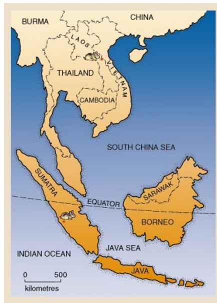
Figure 1 Map of Southeast Asia showing the Sunda islands of Sumatra, Borneo and Java. The site of the first discovery of a striped rabbit in the Annamites of central Laos is marked, as is the Kerinci Seblat National Park in Sumatra, where Nesolagus netscheri was photographed in the wild.

The only previously known striped lagomorph was the critically endangered Nesolagus netscheri , a monotypic rabbit genus endemic to forest habitat within the Barisan