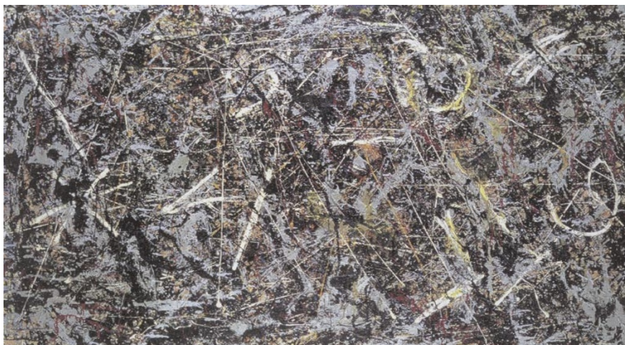
Figure 1 Alchemy , painted by Jackson Pollock in 1947. Drip paintings of this period are characterized by fractal dimensions close to 1.5. Reproduced by permission of ARS, NY and DACS, London, 1999.

With the subject fixating at the centre, a windmill pattern is presented that slowly rotates at 0.2 Hz in one direction for 5 s, and then in the other direction (Fig. 1a). If this is followed by a pattern orthogonal to the windmill, namely concentric rings, diverging and converging for 5 s each at 2 Hz, viewing a blank screen after the concentric rings causes a vivid after-effect of a stationary windmill for a few seconds. This after-effect is quite different from that seen after viewing the concentric rings alone at 2 Hz, if indeed any after-effect is visible. With a cyclical presentation of the sequence shown in Fig. 1a, a striking windmill-like after-effect is always seen after the concentric rings (bottom left blank in Fig. 1a), but no comparable after-effect is visible immediately after the windmill (top right blank in Fig. 1a). We found that the after-effect could be produced if the rings were delayed by up to 30 s, but not after 60 s.