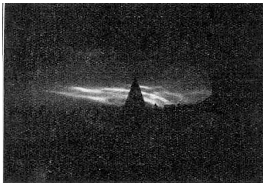
FIG. 1.—Luminous night clouds on August 8-9, 1925, 22 h. 47 m. U.T. Exposure 2 min.

These clouds, discovered in 1885 by Prof. Ceraski, Moscow, may be observed in northern latitudes