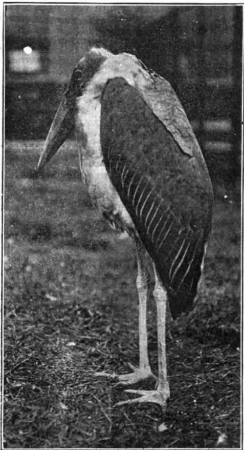
FIG. 2.—A Marabou Stork. From the "New Illustrated Natural History."

Nevertheless, Mr. Protheroe has succeeded in producing a readable, and certainly a remarkably well illustrated volume, which is calculated to attract a large circle of readers. With the exception of the twenty-four coloured plates, the illustrations are from photographs, some of which are naturally better than others. In some instances the photographs, like the one of a tur (p. 169), are taken from immature specimens, which convey no idea of the adult animal. In other cases, as in the so-called Canadian skunk