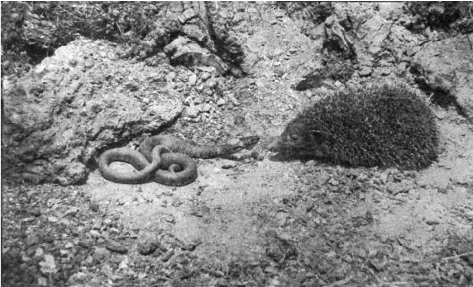
FIG. 2.—Hedgehog and Grass-snake. From "The Nature Book."

(5) Mr. Westell's guide to the natural history of the sea and seashore contains much interesting information, somewhat carelessly stated, and many of the illustrations are very fine. In many cases the coloured plates do not show the natural colours, and the text contains many errors. It is a pity to speak of the "bones of starfish," of the Bass Rock as a "remarkable headland," of Luidia as "one of the largest British brittle-stars," of Polycystina as "shell-fish." Mr. Westell refers frequently and gratefully to Miss Newbiggin's admirable "Life by the Seashore," but the fact that he never spells her name correctly is a trivial illustration of the carelessness which disfigures his book.