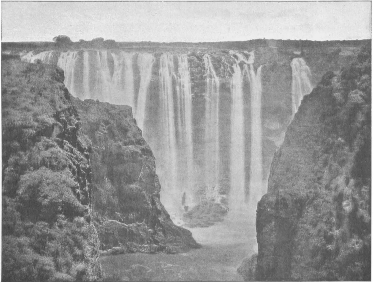
FIG. 2.—View of Victoria Falls seen through the jaws of the Gorge. Danger Point on the left; the promontory of the "knife edge" on the right.

The falls have checked the deepening of the Upper Zambezi, and until they chisel the groove of the Grand Cañon back to the western edge of the basalt sheet, the upper reaches must continue to run at a high altitude and amid low-lying hills. This has prevented the Zambezi becoming a navigable river throughout, and has also had a marked influence on the geography of South Africa.