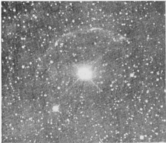
FIG. 1.—The Yerkes Photograph, September 20.