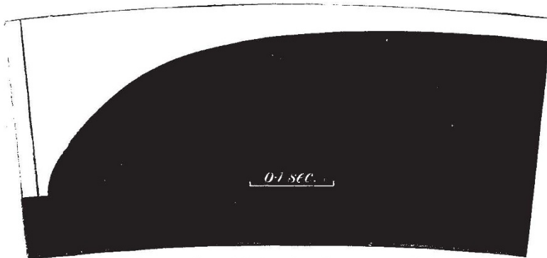
FIG. 7.—Response of veratrinised muscle to instantaneous stimulation.

and this change spreads from the excited spot to parts at a distance at a rate which varies with temperature. The interval of time between the culmination of the electrical response and that of the change of form is much more obvious in the leaf than in the heart, because the mechanism by which the latter manifests itself works very slowly, as compared even with cardiac muscular fibres. This contrast, however, affords no ground for doubting that the two processes are, as regards their intimate nature, analogous.