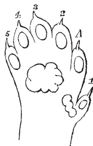
FIG. 6.—Right hind paw from below, with extra toes.