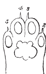
FIG. 8.—Right hind paw from below, normal.

towards tortoiseshell coloration on the back. A rough drawing of the right fore foot, as seen from above and below, is seen in Figs. 1 and 2. Drawings of a normal right fore foot are given in Figs. 3 and 4, for comparison. It is seen that the extra toes are those labelled A and B, and they confer the extraordinary breadth upon the foot. The most recently added is B, which is still partially coalesced with A, and has but one pad in common with it (Fig. 2). This last toe, B, was absent in the cat which I received from Mr. Vaughan. In the first family described, Nos. (1) and (2) possessed the largely developed extra toe, A, while the insignificant pollex (Fig. 1, 1) was absent, and thus the foot appeared extremely broad, although with only the normal number of toes. In walking the pollex does not touch the ground, but the claws A and B come down a little later than the rest of the foot, making a very distinct click when the cat is walking on floorcloth. This sound is particularly audible when the cat is coming down stairs. Comparing the pads on the underside of the foot with those of a normal animal (Figs. 2 and 4), there is seen to be an extra pad behind the additional toes, of which there is no trace in the normal foot. The left foot is similar to that drawn, except that there are traces of more complete fusion between the toes A and B in the slighter tendency towards division shown by their common pad. The right hind foot from above and below is given in Figs. 5 and 6, and a