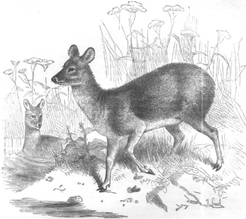
FIG. 5.—The Water-deer.