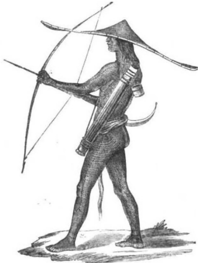
FIG. 19.—Caucasian Type, Malaysia. Mentawey Islander.

From this point of view it will be instructive to compare the native of Pora, Mentawey Group (Fig. 19), with the Battas of Pak-Pak, Sumatra (Figs. 20 and 21), all from von Rosenberg's "Malay Archipelago," vol. i. pp. 56 and 192. Owing to their splendid physique and "Caucasian features" Junghuhn and Van Leent take