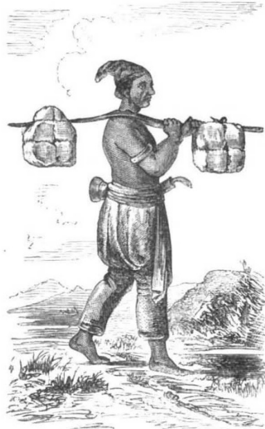
FIG. 20.—Caucasian Type, Sumatra. Native of Batta Land.

these Sumatran Battas as the typical unmixed or pre-Malay element in the Archipelago, whom they would accordingly group collectively as the Batta race. The form Battak often occurs, but this is simply the plural of Batta, so that to write Battaks , as many do, is a solecism. Compared with the Malays proper, the Battas are tall and muscular,