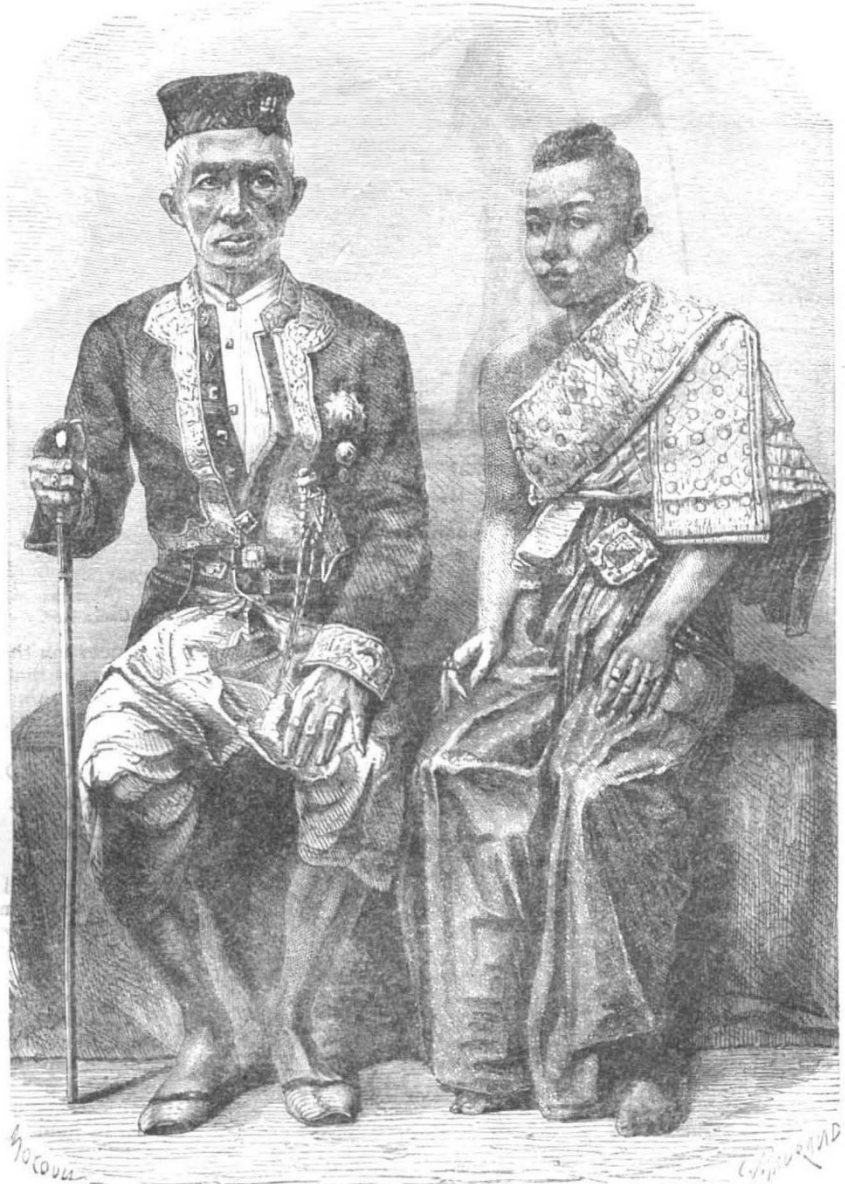
FIGS. 17, 18.—Mongoloid Types, Indo-China. King and Queen of Siam.

to group as Indonesians, and whose relations to the Eastern Polynesians he has been one of the first to perceive. Noteworthy amongst these Indonesians, Pre-Malays, or Indo-Chinese Caucasians still unaffected by Mongol influences in the Archipelago are the Mentawey Islanders, who, though occupying the Pora Group some seventy miles off the west coast of Sumatra, are none the less closely related in physique, language, and customs, to the Eastern