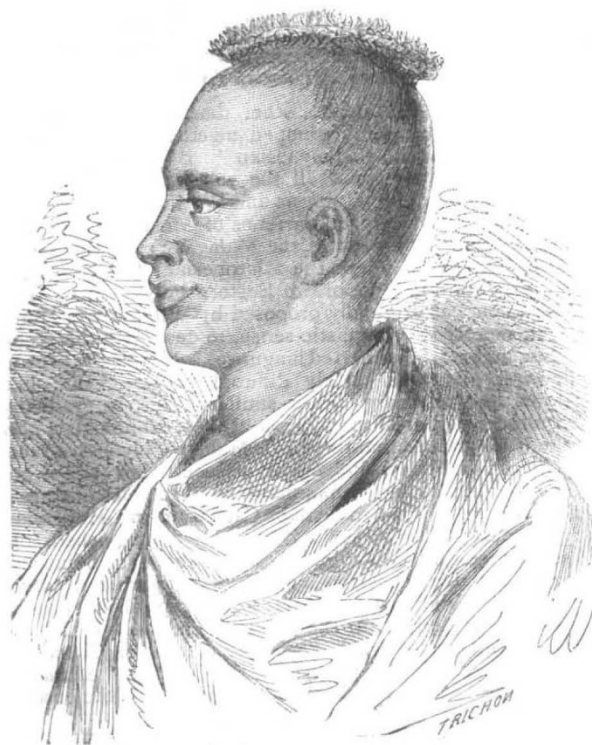
FIG. 14.—Caucasian Type, Indo-China. King of Camboja.