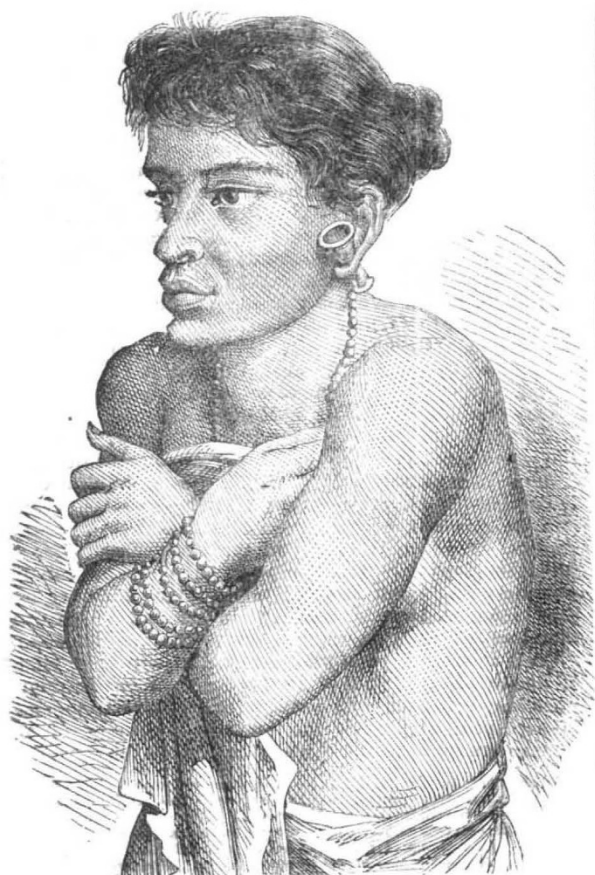
FIG. 15.—Caucasian Type, Indo-China. Stieng Savage, Cochin-China.

referred to under diverse forms as the original home of the race, or otherwise persists, as shown in the subjoined list, which will also serve to illustrate the permutation of letters in all these closely-connected dialects :—