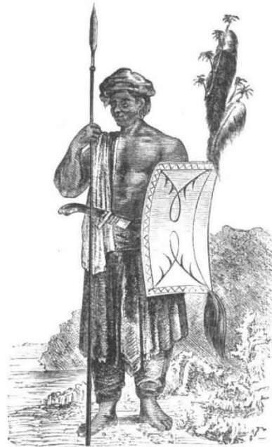
FIG. 21.—Caucasian Type, Malaysia. Native of Pak-Pak, Batta Land.

Monde , April 12, 1879, p. 234). We therefore separate this Batta, Indonesian or Pre-Malay element in the Archipelago from the Malay element proper, affiliating the former to the Indo-Chinese and Eastern Pacific Caucasians, the latter to the Indo-Chinese Mongolians. Whether the Caucasians are found in other parts of East