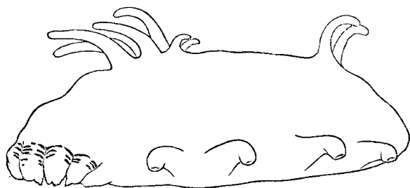
FIG. 1.— Elpidia glacialis , Théel. Side view.

ALTHOUGH the Holothuridea show a greater tendency to a bilateral arrangement of their internal organs than any other group of the Echinodermata, most of them are fusiform or cylindrical in shape, and the radiate symmetry prevails so far externally that the five radial ambulacral vessels and their appendages are similar, that they run symmetrically at equal distances from one another from the oral to the apical pole, and that they are used indifferently for the purposes of progression. In all Holothuridea, however, two ambulacra, those of the bivium , are essentially dorsal, while the three ambulacra of the trivium are ventral; and in one little group of the ordinary Dendrochirota, which includes the well-known genus Psolus , a very distinct ambulatory tract is defined