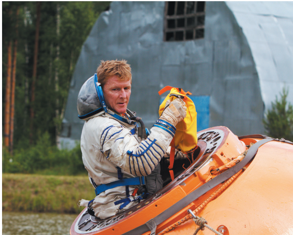
British astronaut Tim Peake will board the International Space Station later this year.