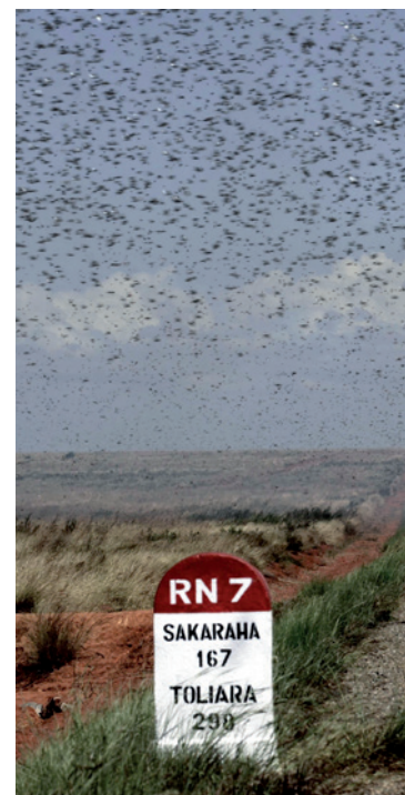
Global risks and losses from extreme weather, as in Thailand's 2010 floods, and agricultural failures, such as locusts destroying crops in Madagascar, are rising.

► countryside to cities affects water, food, climatic and energy systems planet-wide.