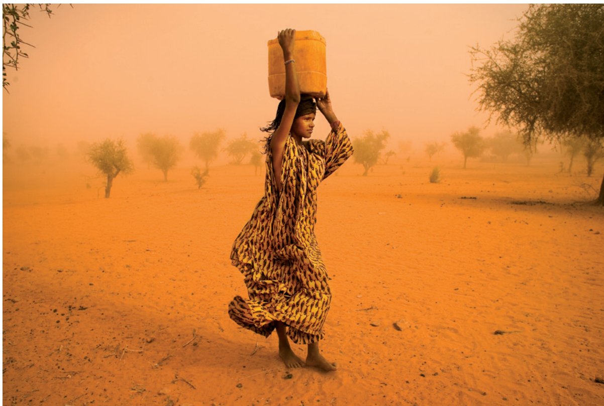
A Tuareg woman carries water through a sandstorm in drought-ridden Mali.