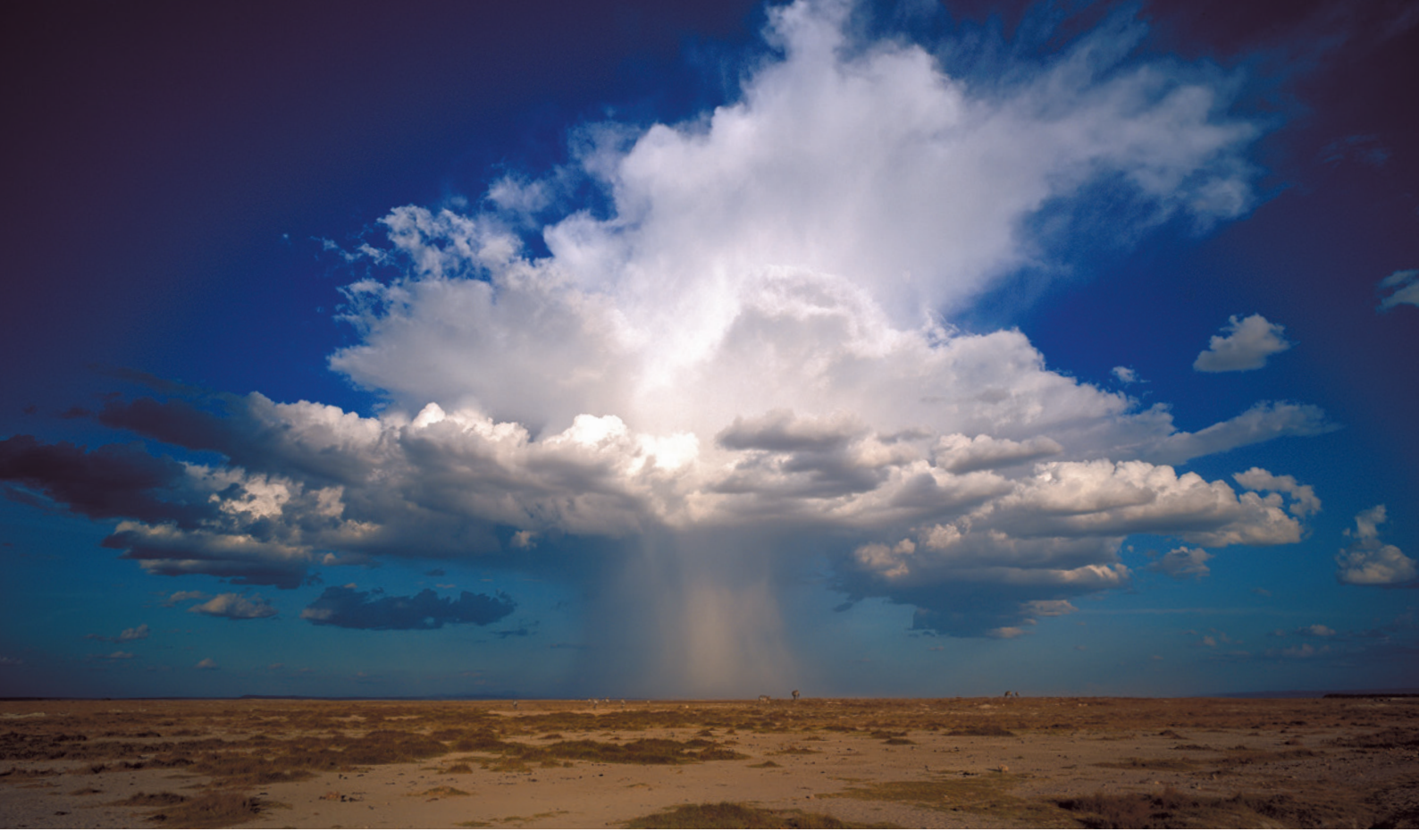
Local effects such as thunderstorms, crucial for predicting global warming, could be simulated by fine-scale global climate models.