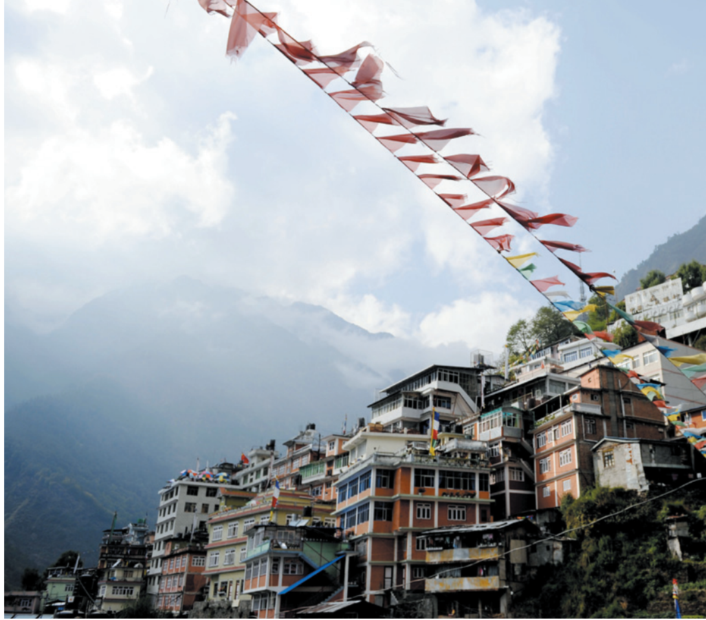
Plans are afoot to improve landslide monitoring for the endangered town of Zhangmu in Tibet.