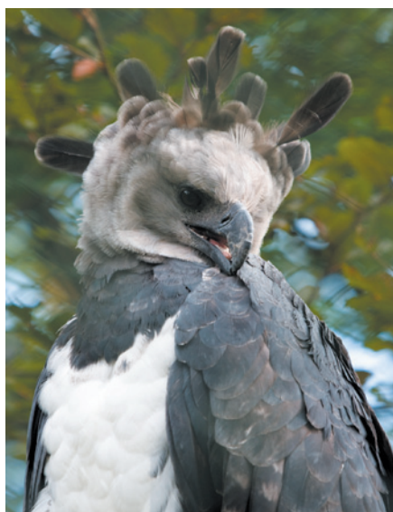
Cichlid fish, jaguars and harpy eagles are among the many species threatened by the Nicaragua Canal.

the extraordinary concentrations of endemic species in the Mesoamerican Biological Corridor are experiencing rapid habitat loss. This crucial biodiversity hotspot is a conservation system established in 1997 by Mexico and the countries of Central America to limit human activity and to create a safe migratory corridor between North and South America.