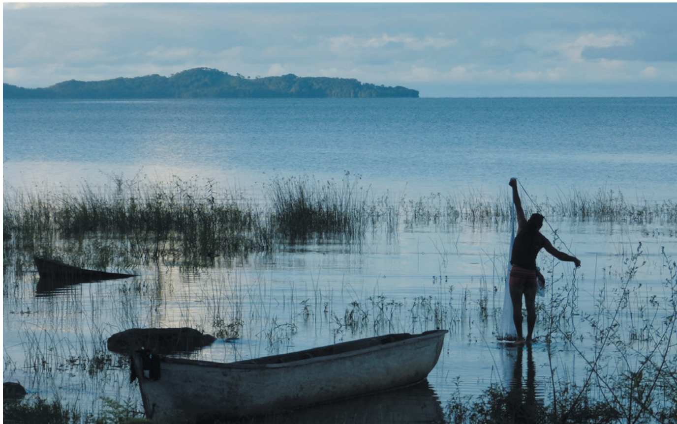
Lake Nicaragua is the largest drinking-water reservoir in Central America and is home to fish species key to evolutionary science.