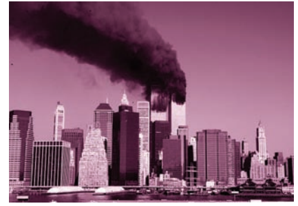
People who buy into one conspiracy theory—such as the claim that the moon landing was faked—are more likely than others to adopt further fringe ideas, perhaps believing that the government is suppressing evidence of aliens or that the attack on the World Trade Center was an inside job.