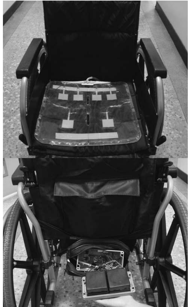
Figure 1 A custom data logger with six force sensor resistors (FSRs).

The data logger used in this study included a microcontroller (Tattletale model TFX-11, Onset Computer, Bourne, MA, USA) with six force sensor resistors (FSRs, 3.8 \times 3.8 \text{ cm}^2 , Interlink Electronics, Camarillo, CA, USA) (Figure 1). Six FSRs were sealed within a plastic mat in two rows: two in the front row and four in the rear row to record any change of weight distribution around the thigh and ischial tuberosity regions, respectively. Custom circuits were constructed and connected between FSRs and the microcontroller TFX-11 through a rubber serial cable. Any force data on FSRs were recorded with the time of the event in the flash memory of the microcontroller TFX-11. The data logger was designed to collect up to 11 days at a sample rate of 10s or 100 000 time stamps. The sampling rate was selected as 10s so that six FSRs could be recorded without running the risk of the memory overflowing during the collection period. Besides, we defined that if any lift-off activity was longer than 10s, it