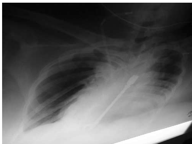
Figure 3 Chest X-ray, taken on 1 July 2002 (11 days after nephrostomy), shows clear lungs. The lung volume is restricted due to kyphoscoliosis

Chest X-rays taken at 4, 6 and 11 days after nephrostomy showed clear lungs; but the lung volume was restricted due to kyphoscoliotic deformity of the vertebral column (Figure 3). A CT scan of the abdomen, which was performed 5 days after nephrostomy, showed the nephrostomy tube located in the proper position within the right kidney. There was still moderate right hydronephrosis (Figure 4). There was no evidence of any perinephric or other abdominal collection. The left kidney was not identified. A nephrostogram was performed 8 days after percutaneous nephrostomy. Calculi were seen in the pelvicalyceal system. There was some narrowing at the level of the pelvi-ureteric junction. However, contrast flowed freely into the right ureter and then into the ileal loop (Figure 5). This led us to conclude that anuria was the result from a ball-valve-type obstruction due to one of the calculi now lying freely in the renal pelvis. At 3 days after nephrostomy, crepitations were noted in the chest. In order to prevent pulmonary oedema, fluids were restricted (intake: 1404 ml; output: 2388 ml). At 17 days