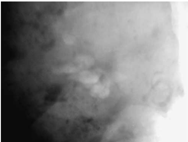
Figure 1 X-ray KUB of 28 March 1995 shows staghorn calculus in right kidney

In 1991, a routine intravenous urography (IVU) showed opaque calculi in the lower pole of right kidney, which was functioning. In 1995, a routine IVU showed right staghorn calculus (Figure 1) and hydronephrosis. Marked thoraco-lumbar scoliosis was noted. In 1997, a routine IVU showed excretion of contrast by the right kidney. There was loss of cortical thickness with dilatation of the pelvicalyceal system consistent with chronic pyelonephritis. In May 1999, the IVU revealed a dilated right calyceal system with marked cortical thinning (Figure 2). In August 1999, MAG 3 renogram showed a single functioning right kidney demonstrating poor uptake of 2.9% at 2 min. The excretion was slow. An ultrasound scan of the right kidney was performed in December 1999; the scan showed dilatation of the upper pole calyces with rather good overlying cortical thickness. However, there was loss of cortical thickness over the mid- and lower poles of the right kidney. A staghorn calculus was noted.