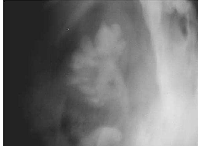
Figure 2 IVU of 18 May 1999 shows the right calyceal system dilated. There is marked cortical thinning

The patient was assessed in 2000 for pyelolithotomy. Her weight was 53.7 kg. Blood pressure was 145/95 mmHg. The respiratory rate was 30 per minute at rest. The patient became dyspnoeic on mild exertion. She had no daytime somnolence. She would sleep on an air mattress with two pillows in a propped-up position. She was very short with a protuberant abdomen. She had a scar on the right side of the neck from a ventriculo-atrial shunt. She had a more extensive scar on the left side of the neck. Creatinine clearance was 18 ml/min. Tidal volume: 150 ml. Vital capacity: 470 ml. The results of arterial blood gas analysis, which were performed on 20 March 2000, were as follows.