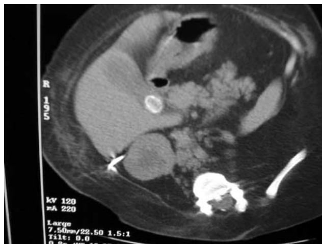
Figure 4 CT of abdomen, performed on 25 June 2002 (5 days after nephrostomy), shows that there is still moderate right hydronephrosis. A gallstone is seen in the gall bladder. The left kidney is not identified