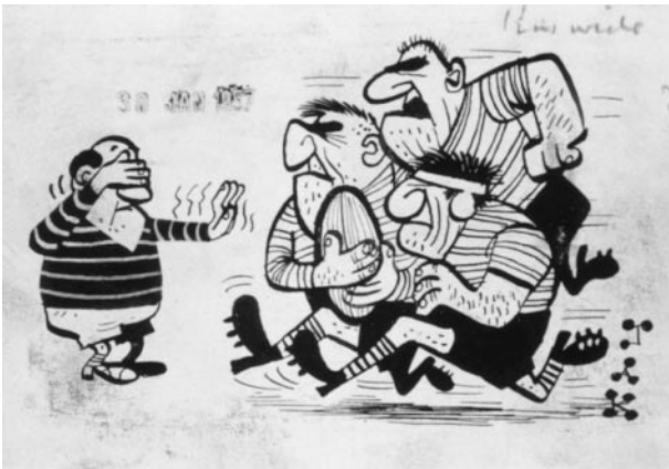
Figure 2 Unfit players are likely to get injured