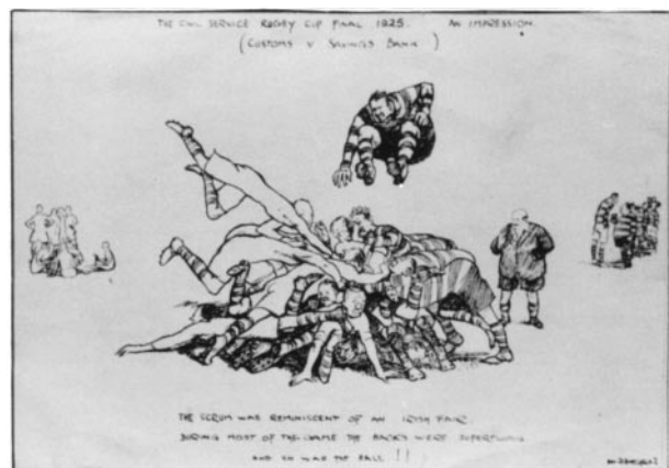
Figure 3 This picture drawn in 1925, although humorous, does get the flavour of rugby played at that time. The players jumped on top of each other and subsequently had their necks broken