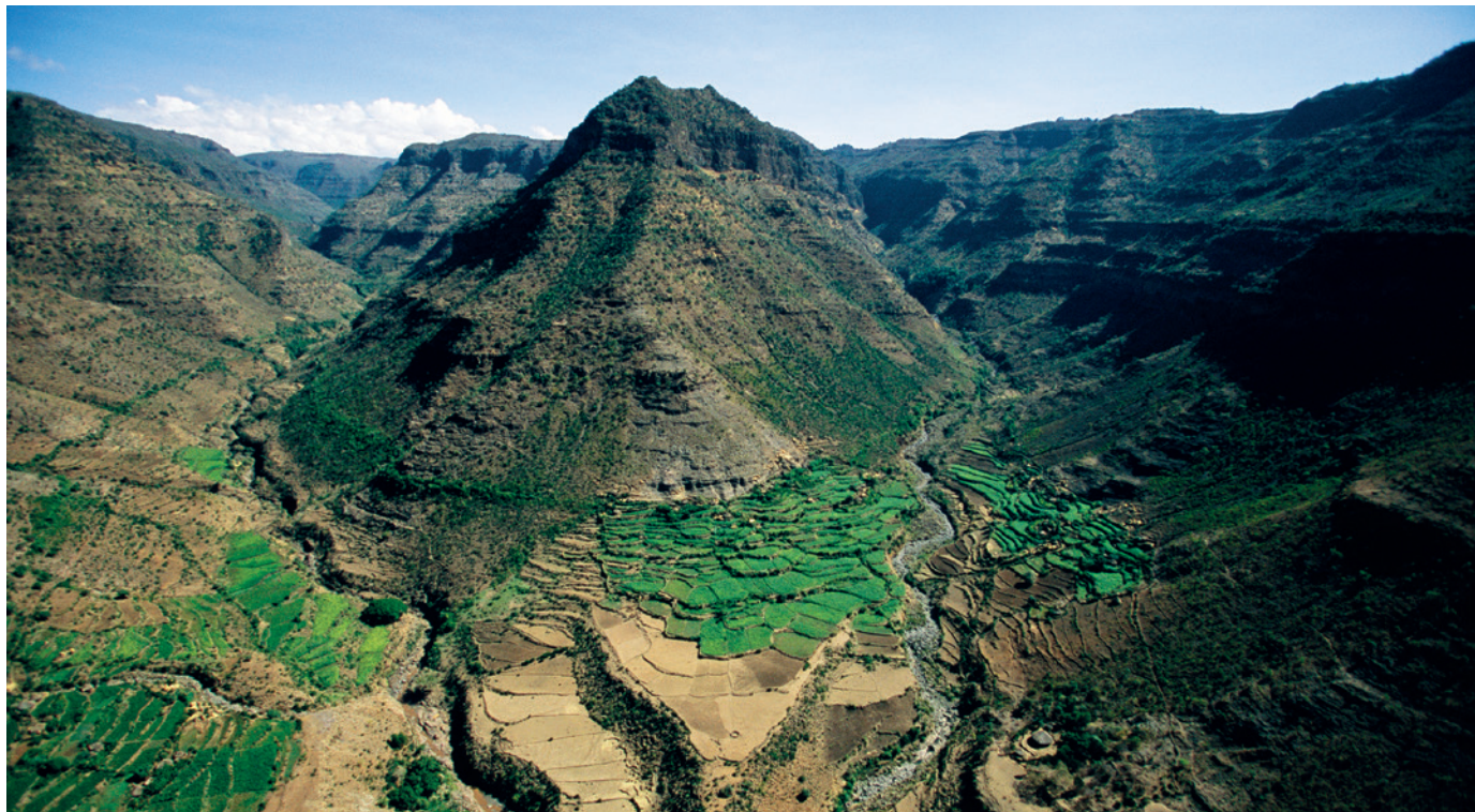
Terraced fields in the Simien Mountains, Ethiopia, help to conserve soil moisture.