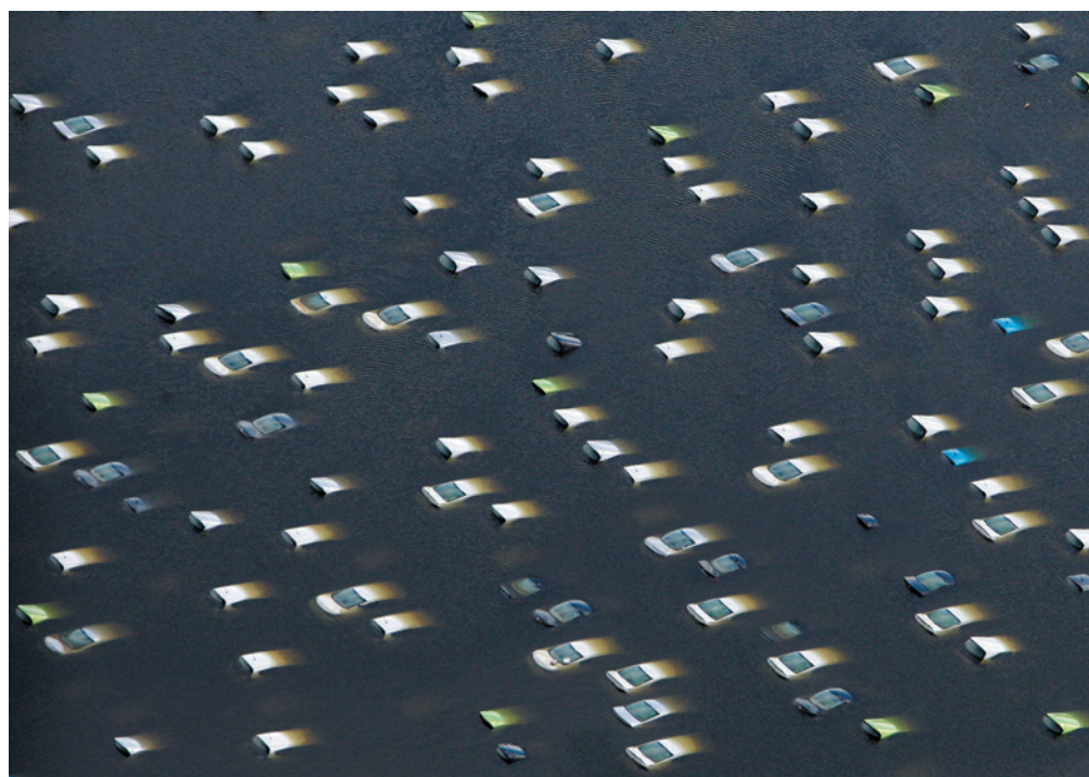
Submerged cars from a Honda factory after floods in Thailand in 2011.

"With the wrong focus, we will protect the wrong places with the wrong tools."