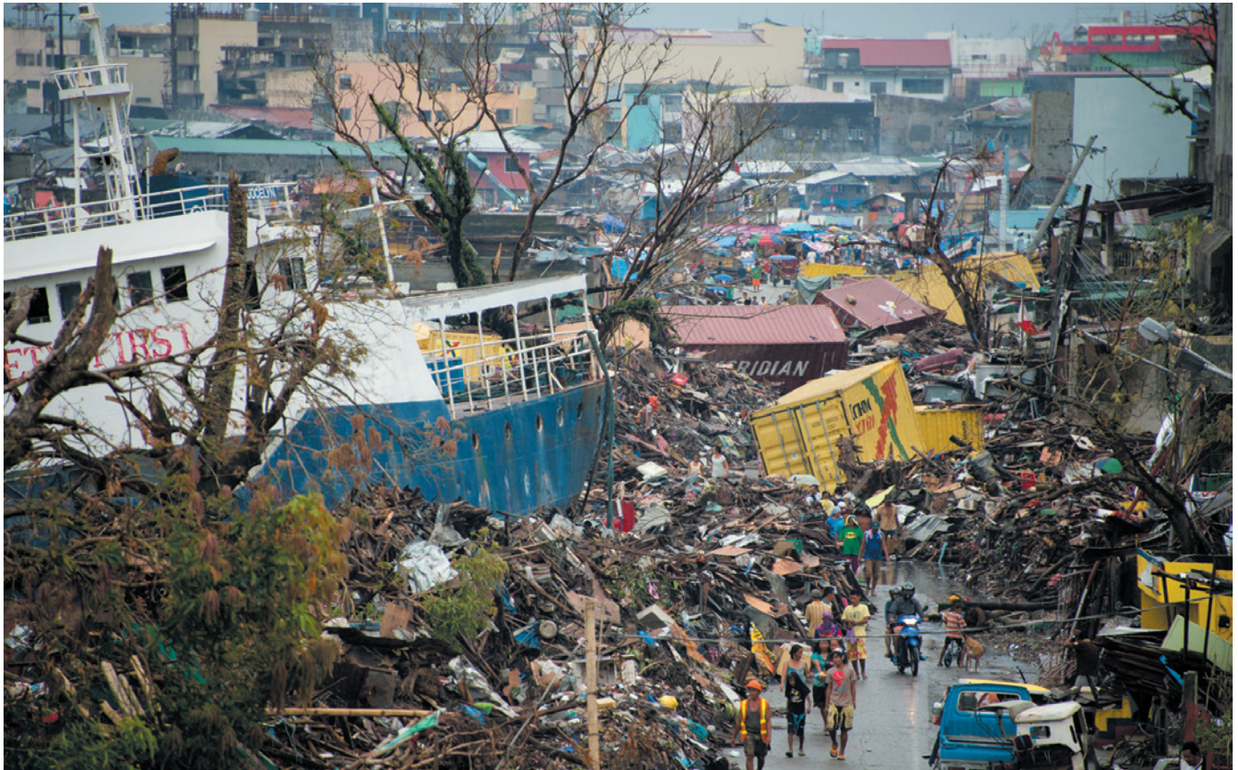
A ship and containers washed ashore by Typhoon Haiyan, which ravaged the Philippines in November 2013.